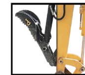
Hyd. Under Stick Weld on Thumb