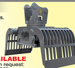
44" AVAILABLE Others on request: 24", 36", 55"

Ideal for wood, C&D, recycling, landfill & transfer station apps. Two styles available, hanging or out of position. Replaceable bolt-on cutting edges. Heavy duty rotator w/ oversized slew ring. Comes standard with full 360 degree rotation.