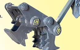
Mechanical Concrete Processor

Hardened, heat-treated pins & bushings at pivot point. Optional rebar cutters in throat, AR-replaceable weld in teeth. For Processing: concrete slabs, pilings, precast poles, ect.