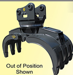
Out of Position Shown

2/3, 3/4 4/5 Available AVAILABLE! on request. Not Stock (HANGING & OUT OF POSITION) AVAILABLE!